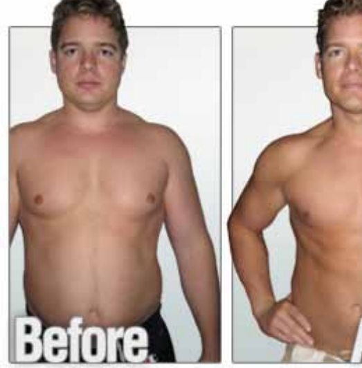
Here I am before losing 32 Ibs of belly blubber. Even though I was a nutrition expert I still didn't have the energy and willpower to lose the weight.

But being overweight wasn't all negative. From it, I learned exactly what it's like to "walk a marathon" in my students' shoes, and I uncovered some powerful (and sometimes weird) ways to help good folks battle the bulge FAST.